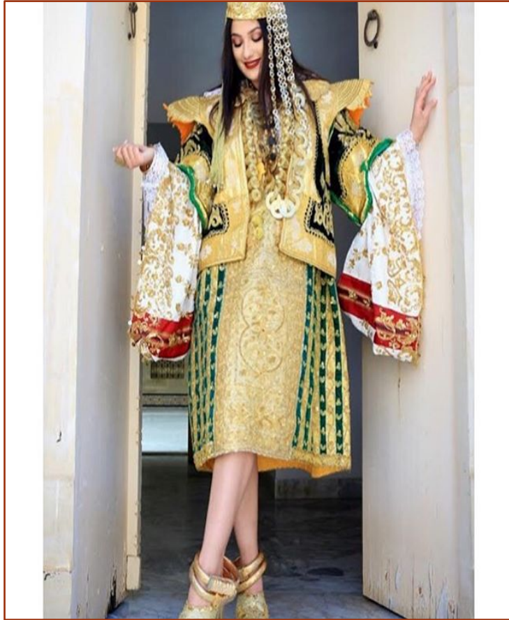
Fouta and Blouza