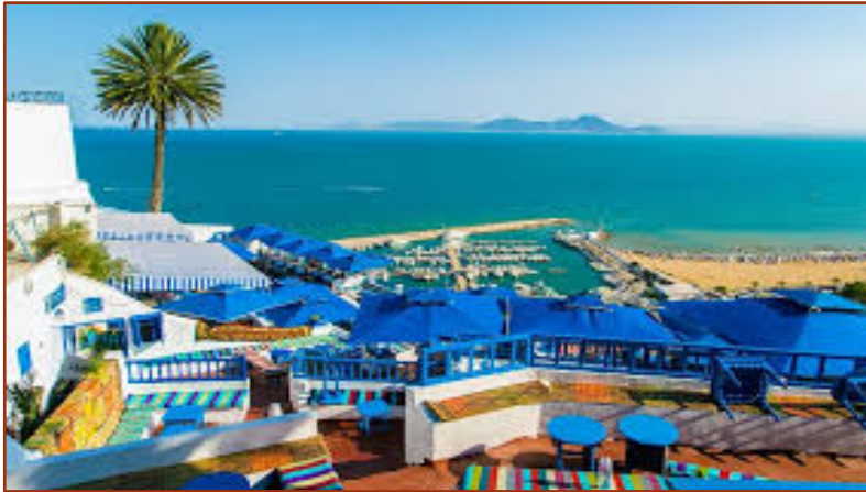
Sidi bou saïd